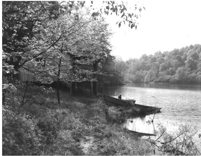
Closer view of the cabin. The boat was extensively put to use since there apparently wasn't a beach and such. PB