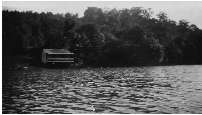
Two photos of the reservoir and cabin. PB